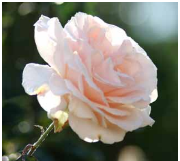
White Delight Rose