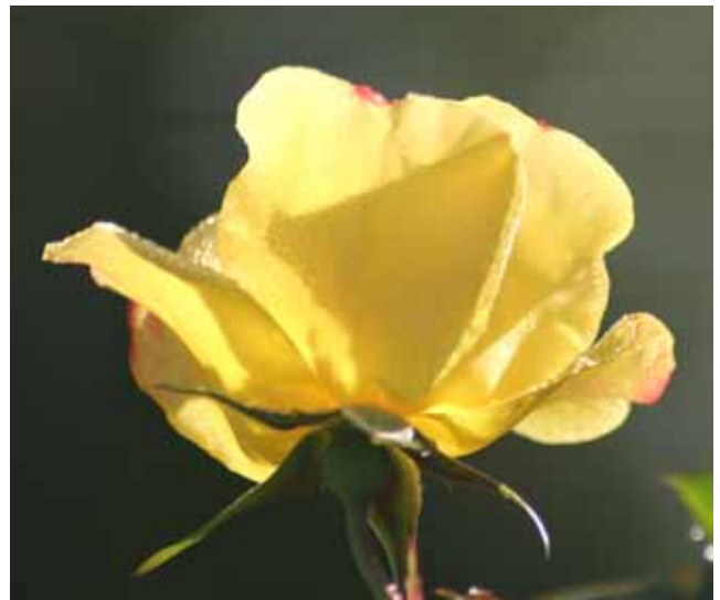
Flutterbye Rose