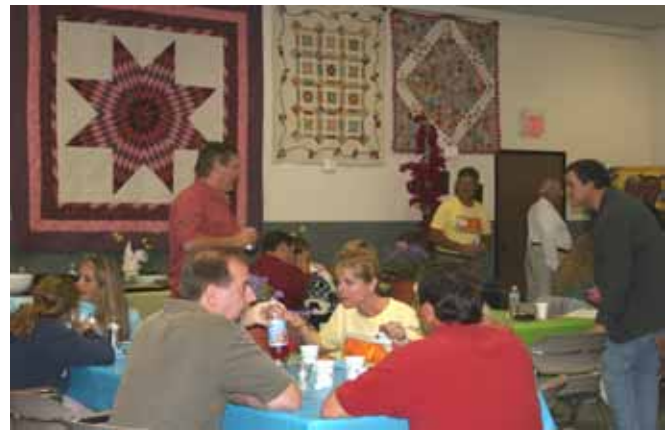
Enjoying the Spring Fling Potluck held as part of the America In Bloom festivities in April.