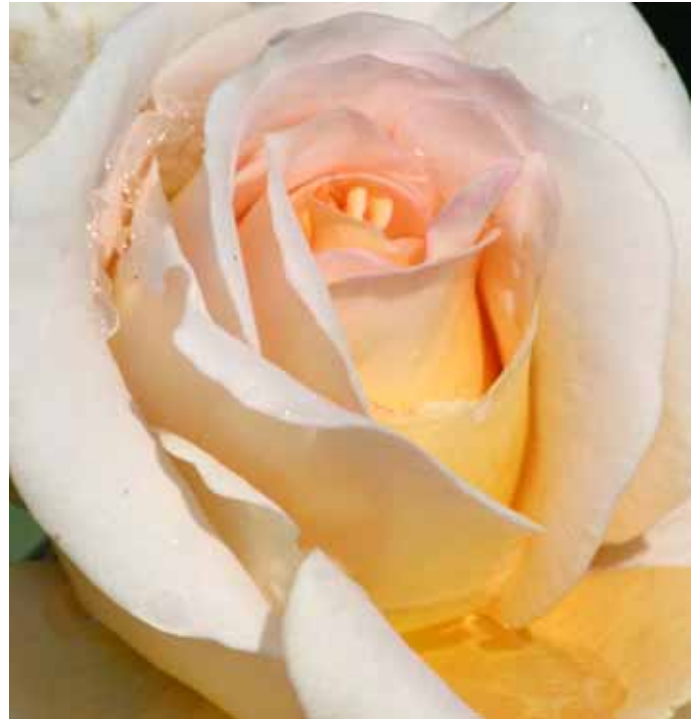
Peace Rose.

Fertilize citrus, avocado, berries and grapes.