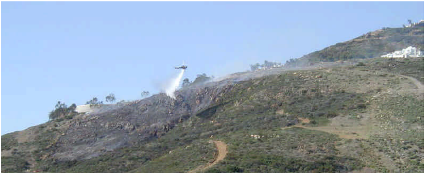
California Department of Forestry helicopter fights Paint Mountain Fire